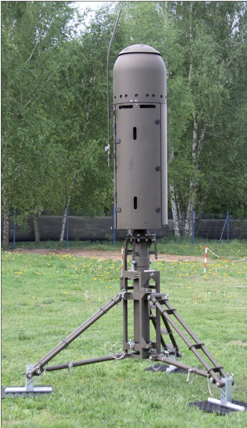
■ VERA-NG system