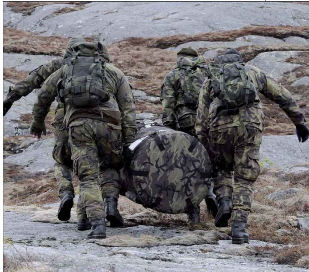
Manhandling of the VERA-NG radar at the Unified Vision 2014 exercise in Norway. Title photo: VERA-E system on exercise in Norway in 2006.

To increase the probability of radar detection, two orthogonal polarizations should be processed ideally. The most spread polari-